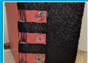
Cross Structure Binding, Book of the Month