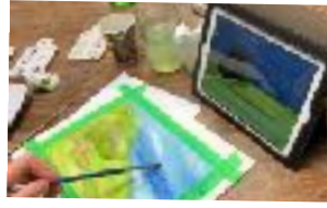
ABSTRACT LANDSCAPE WATERCOLOUR WITH PATTI WATERFIELD