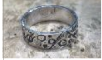
RING WORKSHOP WITH MORAG BUDGEON