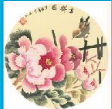
Chinese Brush Painting