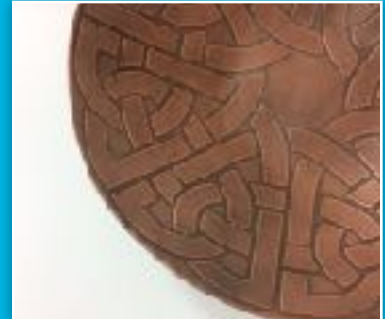
Copper Etched Dish